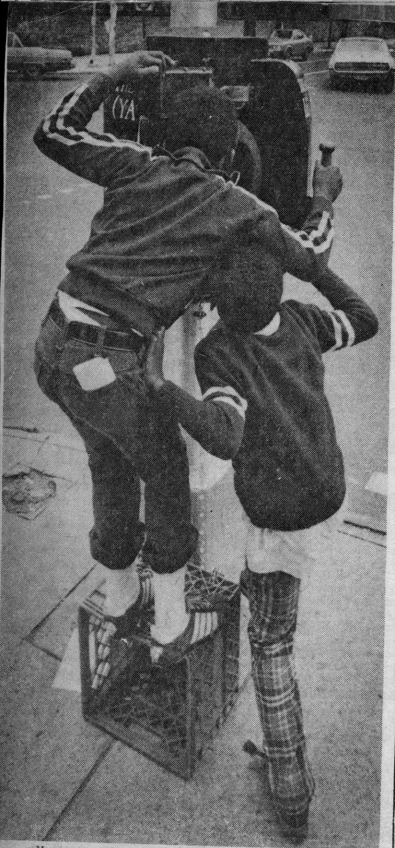
Youngsters check display Thursday at Elm and York.