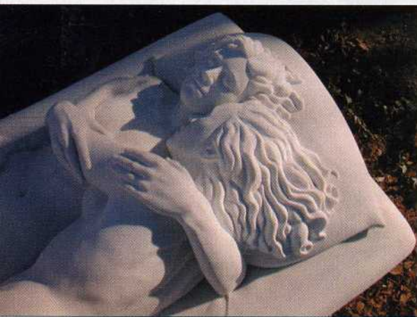
Patricia Cronin, Memorial to a Marriage (detail), 2000–2, marble installation at Woodlawn Cemetery.