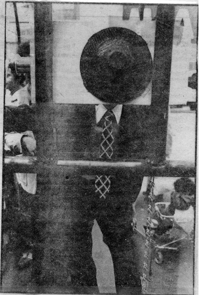
"This is the place . . . it happened here."